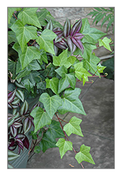
Algerian Ivy foliage

When grown indoors, Algerian Ivy can be expected to grow to be about 10 feet tall at maturity, with a spread of 3 feet. It grows at a fast rate, and under ideal conditions can be expected to live for approximately 30 years. This houseplant performs well in both bright or indirect sunlight and strong artificial light, and can therefore be situated in almost any well-lit room or location. It is very adaptable to both dry and moist soil, and should do just fine under average home conditions. The surface of the soil shouldn't be allowed to dry out completely, and so you should expect to water this plant once and possibly even twice each week. Be aware that your particular watering schedule may vary depending on its location in the room, the pot size, plant size and other conditions; if in doubt, ask one of our experts in the store for advice. It is not particular as to soil pH, but grows best in rich soil. Contact the store for specific recommendations on pre-mixed potting soil for this plant. Be warned that parts of this plant are known to be toxic to humans and animals, so special care should be exercised if growing it around children and pets.