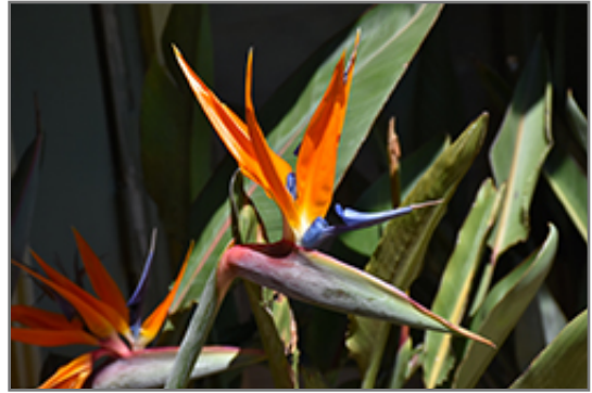
Orange Bird Of Paradise flowers