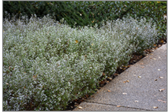
Dwarf Calamint in bloom

Dwarf Calamint is recommended for the following landscape applications;