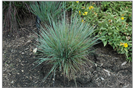
Standing Ovation Bluestem