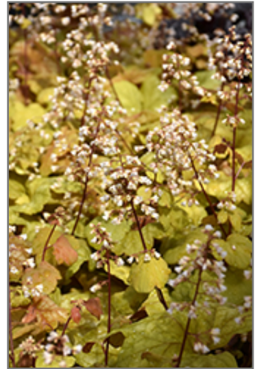
Champagne Coral Bells flowers