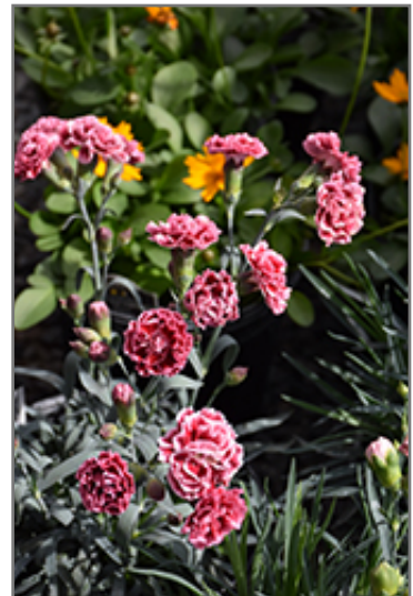
Scent First Sugar Plum Pinks flowers