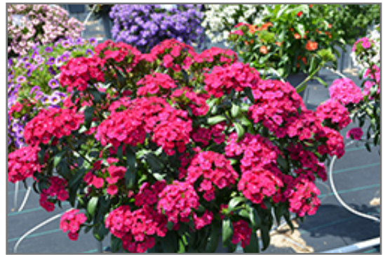
Jolt Cherry Hybrid Pinks in bloom