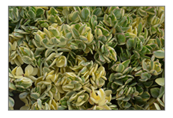
Variegated Jade Plant foliage

heeman.ca | 519.461.1416 20422 Nissouri Road Thorndale, ON N0M 2P0 Family owned and operated since 1963. Open year-round.