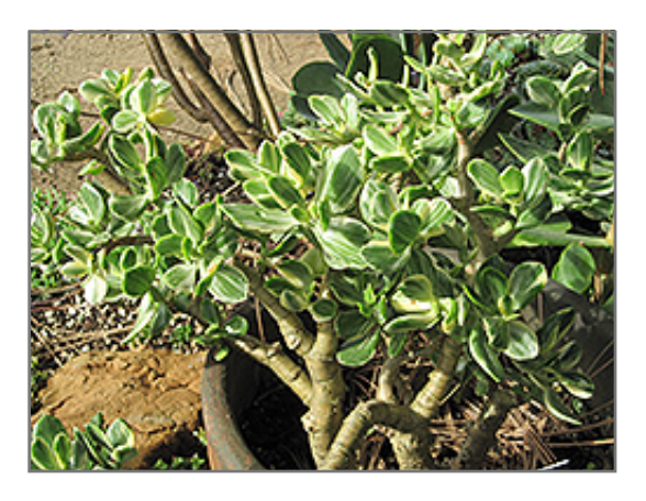
Variegated Jade Plant