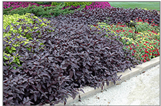
Purple Knight Alternanthera