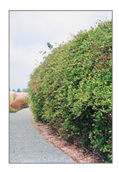
Hall's Japanese Honeysuckle