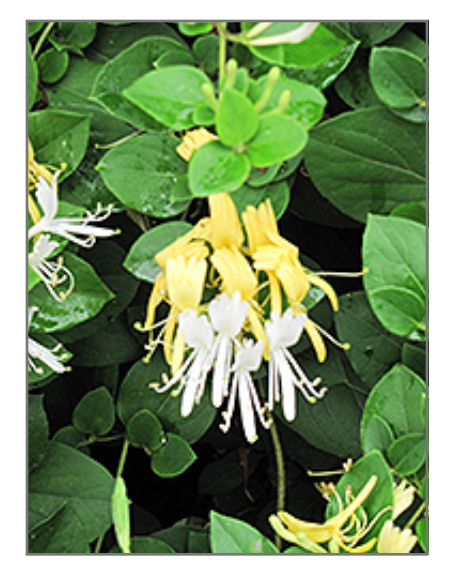
Hall's Japanese Honeysuckle flowers