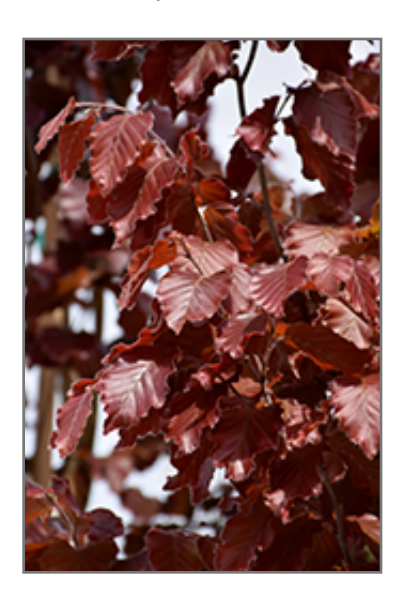
Red Obelisk Beech foliage