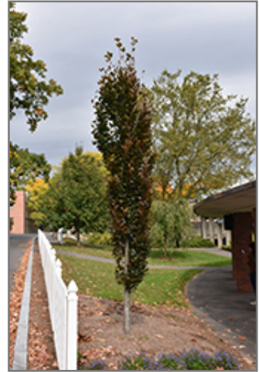
Dawyck Purple Beech