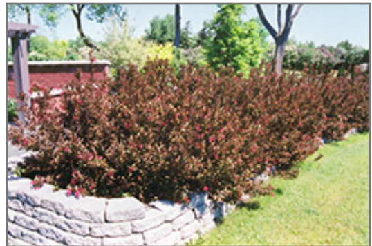
Wine and Roses Weigela