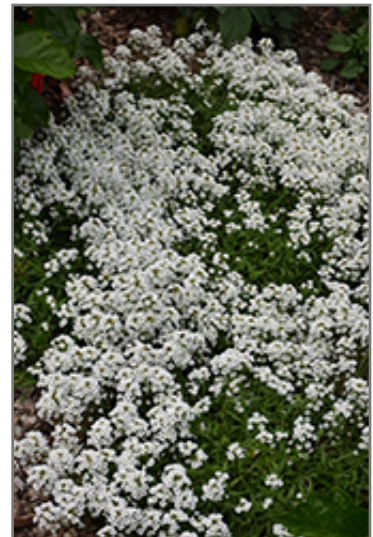
Stream White Sweet Alyssum in bloom