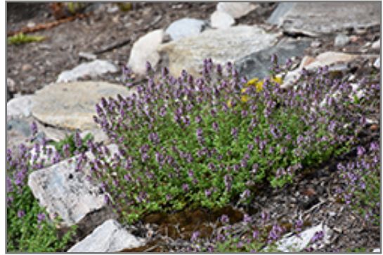
Lemon Thyme in bloom