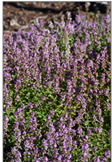
Lemon Thyme flowers