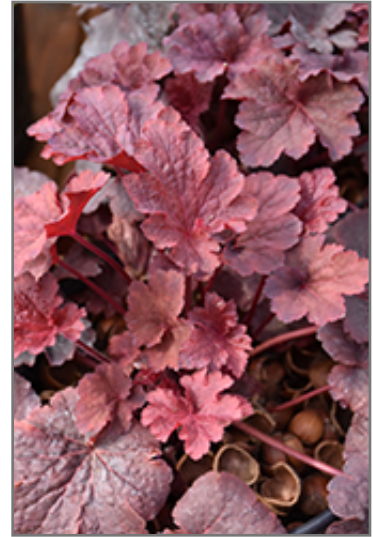
Cajun Fire Coral Bells foliage

Cajun Fire Coral Bells is recommended for the following landscape applications;