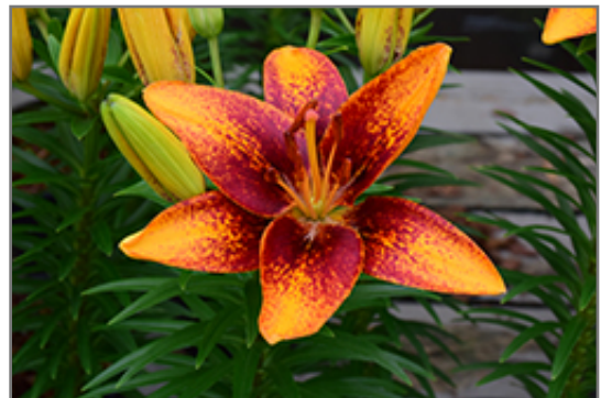
Lily Looks Tiny Orange Sensation Lily flowers