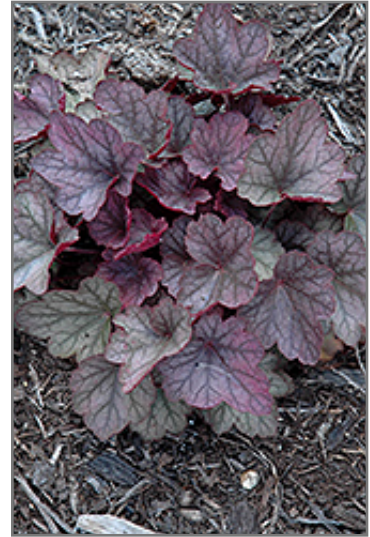
Carnival Rose Granita Coral Bells foliage

Carnival Rose Granita Coral Bells is recommended for the following landscape applications;