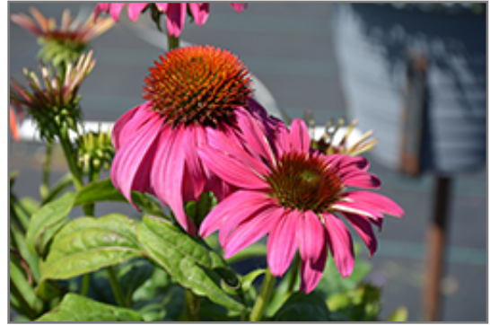
Cheyenne Spirit Coneflower flowers

Cheyenne Spirit Coneflower will grow to be about 16 inches tall at maturity extending to 24 inches tall with the flowers, with a spread of 18 inches. Its foliage tends to remain dense right to the ground, not requiring facer plants in front. It grows at a medium rate, and under ideal conditions can be expected to live for approximately 10 years. As an herbaceous perennial, this plant will usually die back to the crown each winter, and will regrow from the base each spring. Be careful not to disturb the crown in late winter when it may not be readily seen!