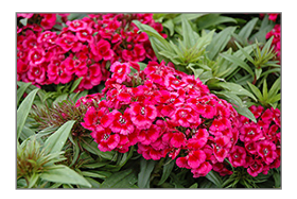
Barbarini Red Rose Bicolor Sweet William flowers