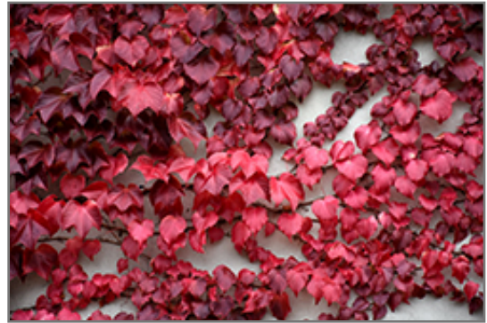
Veitch Boston Ivy in fall