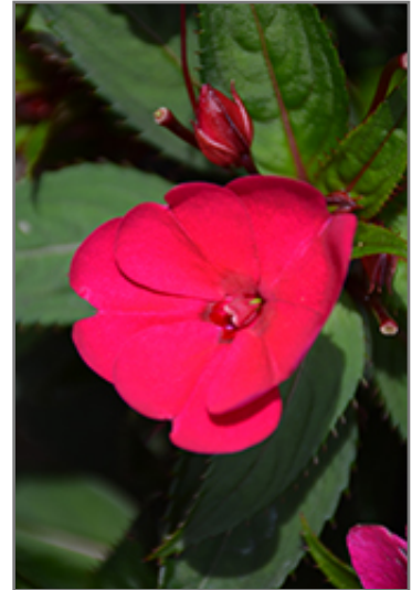
SunPatiens Compact Royal Magenta New Guinea Impatiens flowers

This plant will require occasional maintenance and upkeep, and should not require much pruning, except when necessary, such as to remove dieback. It is a good choice for attracting bees and butterflies to your yard. It has no significant negative characteristics.