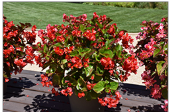
Whopper Red Green Leaf Begonia flowers