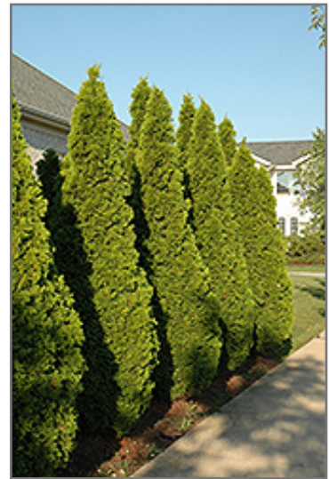
Emerald Green Arborvitae