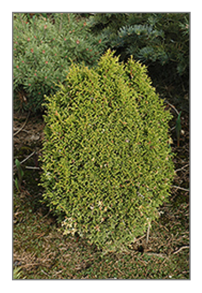
Boisbriand Arborvitae