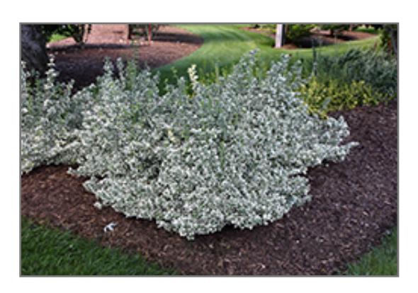
White Album Wintercreeper