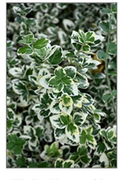
White Album Wintercreeper foliage