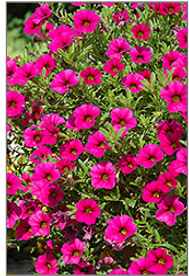
Cabaret Rose Calibrachoa flowers