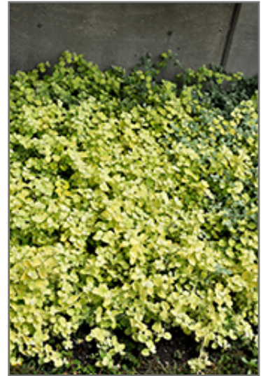
Lemon Licorice Plant