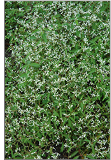
Breathless White Euphorbia flowers