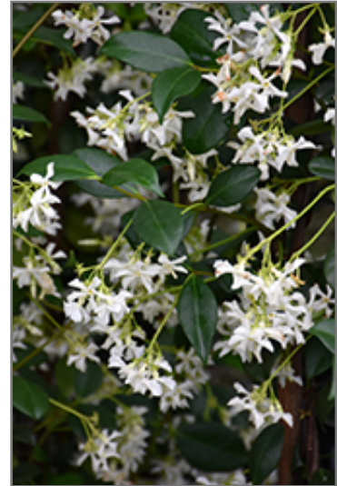
Confederate Star-Jasmine flowers