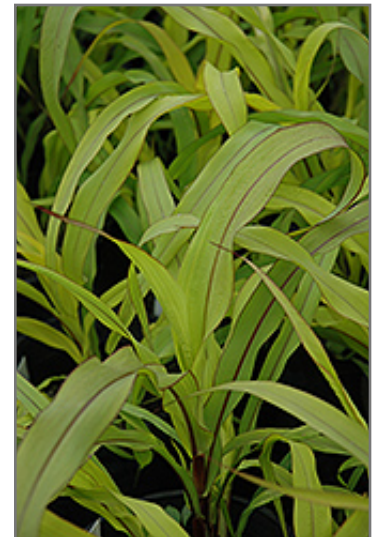
Jester Millet foliage