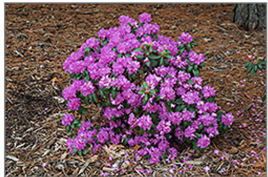
Compact P.J.M. Rhododendron in bloom