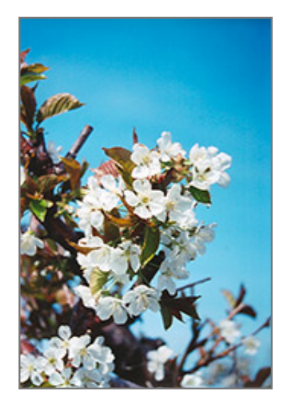
Bing Cherry flowers