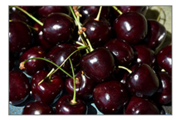
Bing Cherry fruit