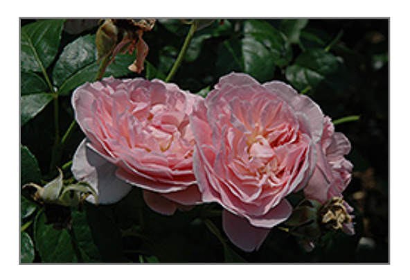
Strawberry Hill Rose flowers

heeman.ca | 519.461.1416 20422 Nissouri Road Thorndale, ON NOM 2P0 Family owned and operated since 1963. Open year-round.