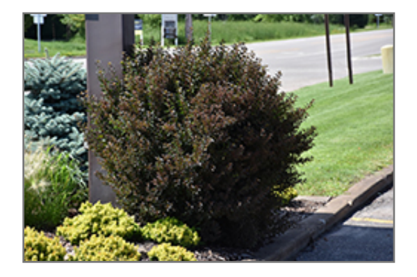
Little Devil Ninebark