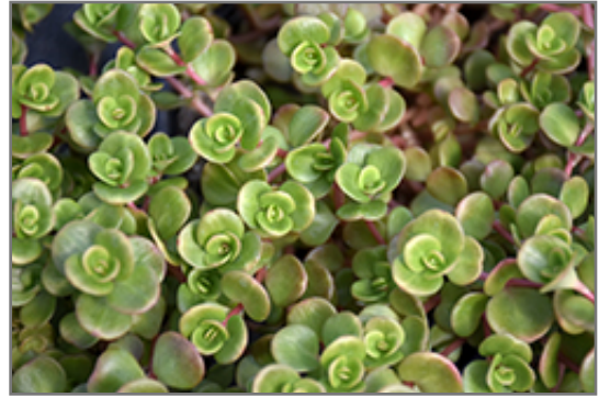
Coral Reef Chinese Sedum foliage